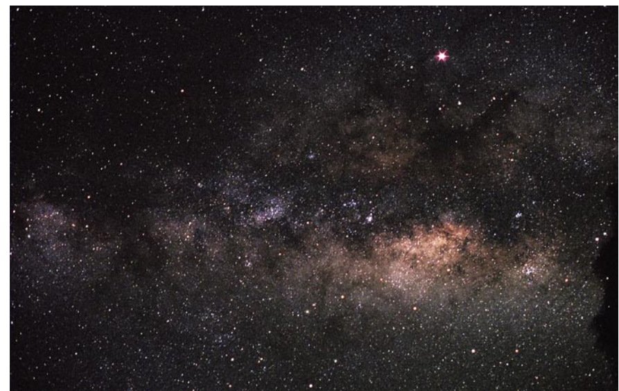
Photograph of the starry sky over La Palma taken on April 20th, 2007, the night when the Starlight Declaration was adopted.