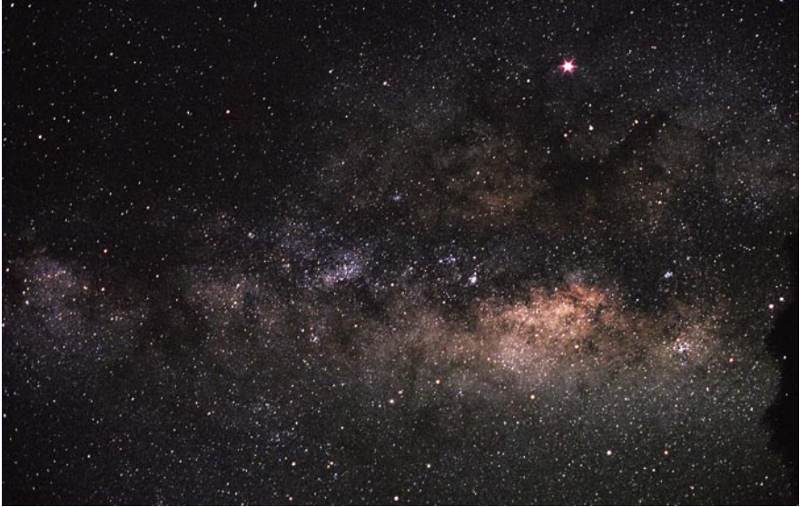
Photograph of the starry sky over La Palma taken on April 20 th , 2007, the night when the Starlight Declaration was adopted.